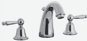
Faucet 291 150 625