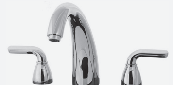
Faucet 295 150 625