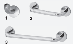
Accessories 1 495 545 625 2 495 650 625 3 495 324 625