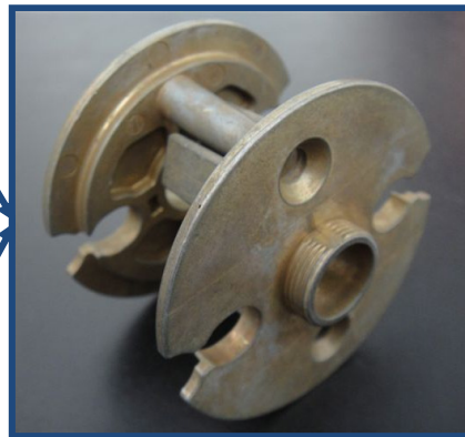
New Consolidated Design 6502.009