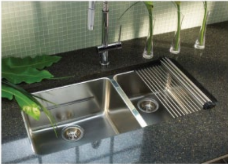
Show with KBX12034 sink, FF-1600 Faucet and KB-3000R Grid Mat