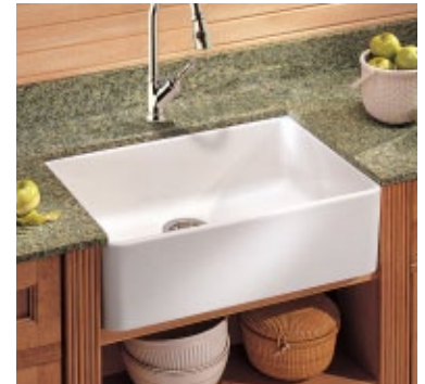
Shown with FHPD500 faucet.

Ideal for adding charm to smaller urban kitchens, this deep and roomy model is glazed on three sides in order to undermount as desired. This exclusive Fireclay sink is created especially for Franke by the world-renowned firm of Villeroy & Boch. With a finish that is extremely hard and scratch-proof, this sink has an ultra-smooth and dirt repellent surface that will remain beautiful for years.